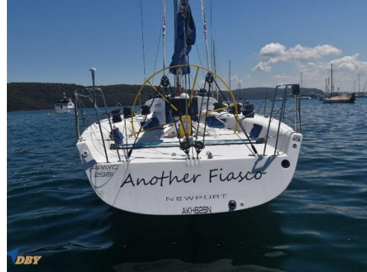
Jutson 43 $125,000

1999 Bavaria 36 was a huge success and popular design for a family or coastal cruiser. They are well renowned luxury yachts, German built and bulletproof. The more popular 3 cabin layout with two symmetrical aft cabins and one V berth which are all privately enclosed from one another. This yacht will get snapped up quickly.