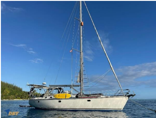
Jeanneau Sun Odyssey 45.1 $215,000

Dazzler was built in 1987 and presents in stunning, upgraded but original condition with All Australian Import Taxes Paid. If you're looking for a stoutly built, easy to manage, blue water yacht then you can stop right here. Bring your clothes, some food and your favourite beverage and cast off the lines for exotic ports around the globe.