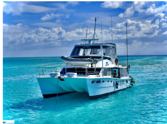
Brava Marine 47ft Catamaran $1,250,000

Calaloo is a custom 32' Maine Lobster Boat built as a launch rather than a working boat and for an Australian client for use on Sydney Harbour. Sea trialled in Maine before being shipped to Sydney her interior fitout was done here and includes beautiful Tasmanian Celery Top Pine for the timber trim and gloss Tasmanian Myrtle and Celery Top internal flooring.