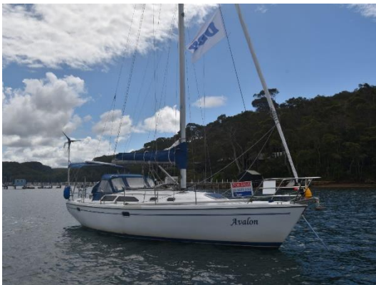
Catalina 36 MK II $120,000

A Jutson 43, launched in Adelaide in 1994. She was designed specifically for the Hobart (has done the race around 10 times) - and won in PHS in 2006, some other results were good as well. (there's plenty of press on her from those years). So, a well-known and proven offshore racing boat - whenever you're in Sydney Harbour people who remember her from back then are forever coming up asking about her.