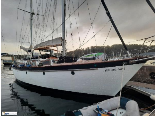
Transpac 49 $198,000

Classic 1979 Transpac 49 solid GRP ketch is the best example we have seen of this popular design. Mia 2 has been marina maintained and is beautifully presented.