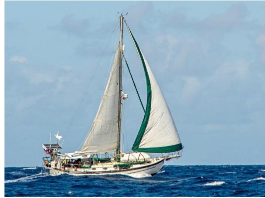
Union Polar 36 $150,000

Her 2-cabin layout is extremely spacious and luxurious. She is akin to a modern apartment but floating.