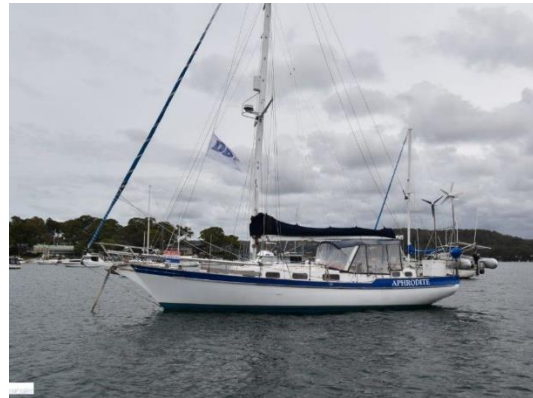
Bluewater 41 $139,000

"Marco" is a 4 cabin 2 head version of Jeanneau's popular Sun Odyssey 45.1 line from 1997. Never chartered. Complete refit 2019. There is plenty of headroom and space inside as well as outside in the wide, super spacious cockpit with direct access to the water. Perfect for outdoor living in the tropics.