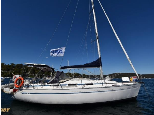
Bavaria 36 $130,000

1999 Bavaria 36 was a huge success and popular design for a family or coastal cruiser. They are well renowned luxury yachts, German built and bulletproof. The more popular 3 cabin layout with two symmetrical aft cabins and one V berth which are all privately enclosed from one another. This yacht will get snapped up quickly.