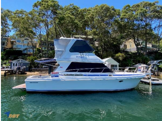
Mustang 3800 Flybridge Cruiser $175,000

This beautifully kept 1996 Mustang 3800 flybridge cruiser, with 2 near new 250 Hino (developing 304hp each) engines.