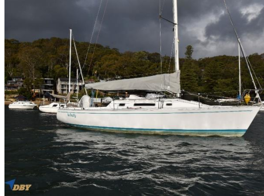
Cavalier 350SL $79,000

Classic 1979 Transpac 49 solid GRP ketch is the best example we have seen of this popular design. Mia 2 has been marina maintained and is beautifully presented.