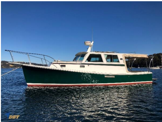
32ft Maine Lobster Boat $175,000

Calaloo is a custom 32' Maine Lobster Boat built as a launch rather than a working boat and for an Australian client for use on Sydney Harbour. Sea trialled in Maine before being shipped to Sydney her interior fitout was done here and includes beautiful Tasmanian Celery Top Pine for the timber trim and gloss Tasmanian Myrtle and Celery Top internal flooring.