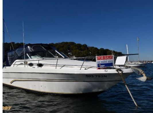
Searay 270 Sundancer $69,000

This beautifully kept 1996 Mustang 3800 flybridge cruiser, with 2 near new 250 Hino (developing 304hp each) engines.