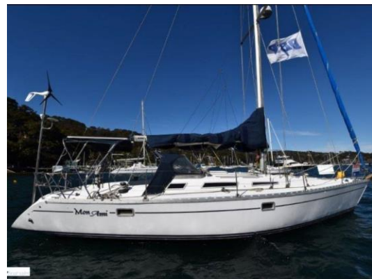
Jeanneau Sun Legende 41 $109,000

2001 model Catalina 36 Mk II, set up well for long distance cruising and has brand new 2022 running and standing rigging. The layout is the roomy 2 cabin version, sleeping 7 in total. Well-presented light and airy interior with numerous opening portlight windows and deck hatches.