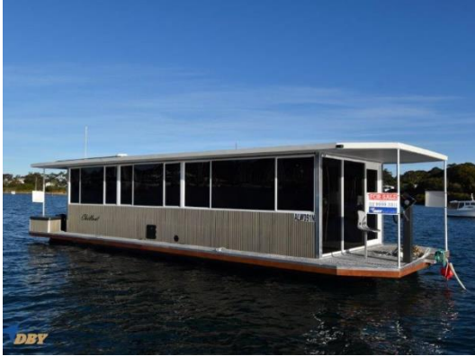
Brand New Houseboat $175,000

Built in 2023, it is open plan and ready to move furniture in. Would make a beautiful home on the water with a full kitchen plus bathroom area. Has solar panels and large house bank batteries for off grid living.