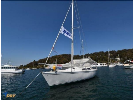
Northshore 33 $59,000

Northshore 33 yachts are a superb example of a family cruiser-racer, and this 1989 example is one of the best we have ever seen. The Usual Suspects is a yacht that is ready to go and will continue to give many more years of sailing pleasure.