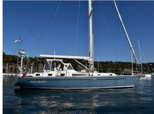
Sparkman & Stephens 48 $265,000

S/Y Desiderata is a premium and stunning 66' classic ketch, rich in history. This vessel adds romance and interest to an already enthralling boat. Sails like a dream and extremely well maintained by its current owners.