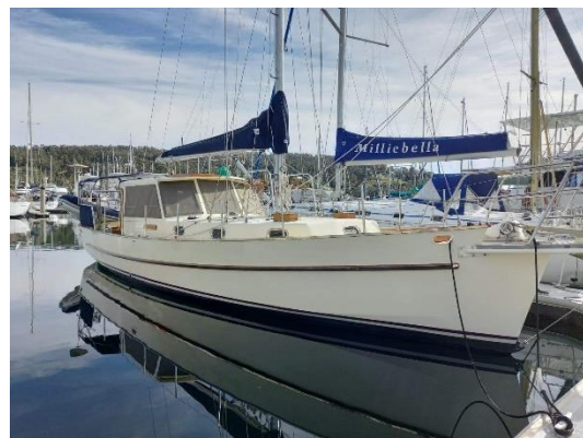
Adams 42ft Pilothouse Motor Yacht $198,000

The Sabre 426 is a cruiser/racer design. Traditional styling and great performance is what has built Sabre Yacht's reputation since its first model was launched in 1970. The Sabre 426 is a sailor's sailing yacht, as comfortable on an overnight with friends as on a long offshore passage.