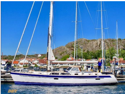
Hallberg-Rassy 48 $1,100,000

Hallberg-Rassy 48, launched 2018 and lying Fiji, is available with every single option that a bluewater yacht can have when ordered new at the factory. A comprehensive inventory is available upon request. This yacht presents equally to a brand new one but you can own her immediately and sail away.