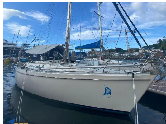
Moody 425 $75,000 USD

Hallberg-Rassy 48, launched 2018 and lying Fiji, is available with every single option that a bluewater yacht can have when ordered new at the factory. A comprehensive inventory is available upon request. This yacht presents equally to a brand new one but you can own her immediately and sail away.