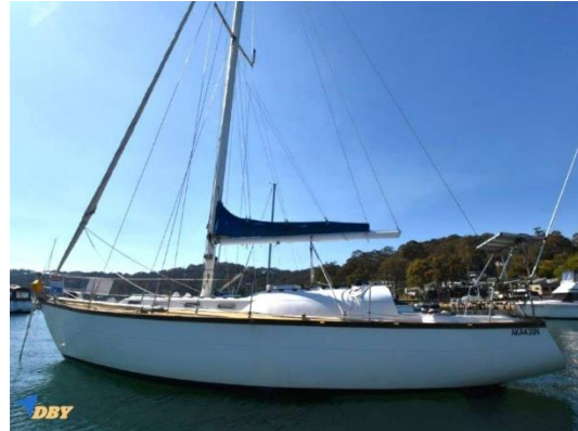
Swanson 36 $45,000

Northshore 33 yachts are a superb example of a family cruiser-racer, and this 1989 example is one of the best we have ever seen. The Usual Suspects is a yacht that is ready to go and will continue to give many more years of sailing pleasure.