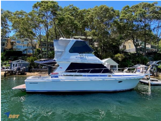
Mustang 3800 Flybridge Cruiser $175,000

What a boat, what an opportunity! 45' Peter Brady designed Power Cat. 47'7" overall custom by Brava Marine in 2009. She was operated in commercial survey in Western Australia: 22 passengers + 2 crew by day, or 12 passengers + 2 crew overnight. Absolutely gorgeous!