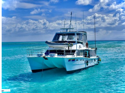
Brava Marine 47ft Catamaran $850,000

Built in 2023, it is open plan and ready to move furniture in. Would make a beautiful home on the water with a full kitchen plus bathroom area. Has solar panels and large house bank batteries for off grid living.