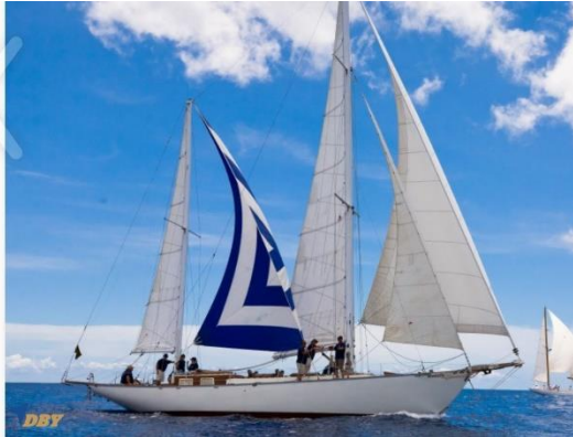
John Alden Malabar 13 $425,000

S/Y Desiderata is a premium and stunning 66' classic ketch, rich in history. This vessel adds romance and interest to an already enthralling boat. Sails like a dream and extremely well maintained by its current owners.