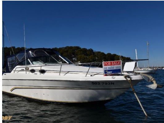
Searay 270 Sundancer $69,000

This beautifully kept 1996 Mustang 3800 flybridge cruiser, with 2 near new 250 Hino (developing 304hp each) engines. This is an outstanding offshore fishing boat or fun cruiser for your family.