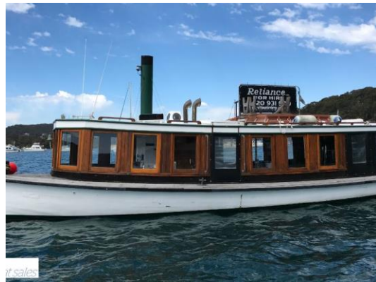
1919 Ferry / Business $200,000

Moreton Bay motor cruisers don't come up for sale very often and this is a prime example of the Don Hewitt designed gentleman's 33ft motor cruiser. Venture is a head turner and will be the boat the other boaties point at when anchoring into your favourite piece of harbour or bay/anchorage.