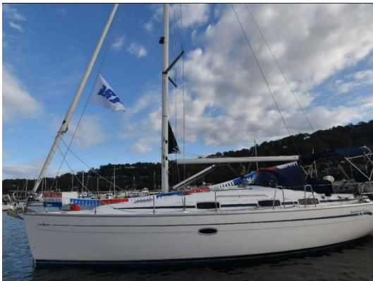
Bavaria 37 $148,000

Looking for something classic? Sophie Wackles is a real head turner with her beautiful lines and spectacular ketch rig. Her hull looks amazing and fair and has only been recently slipped. Built from laminated Mahogany planking and Epoxy resin in 1976.