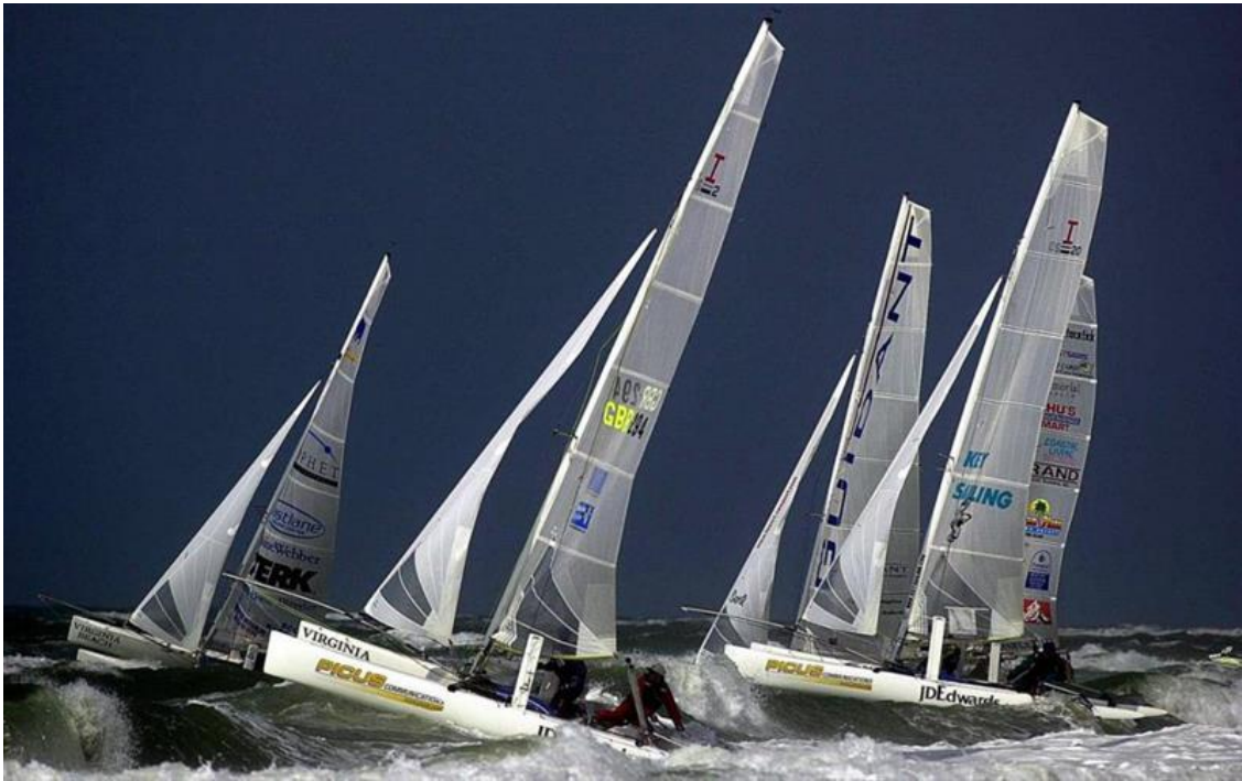
The boats in the Worrell 1000 competing to get first out off the beach.

To understand the race click here for a great explanation on youtube from 2007.