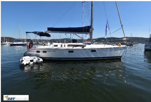
Hunter 376 $110,000

Vanish is fully equipped and ready for her next blue water adventure. Having just completed a tour of Tasmania she is truly turn-key.