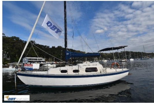
Compass 29 $28,000

ROPAWE is a head turner! She has competed in 3 Sydney to Hobart races with her medals proudly displayed on the bulkhead. The yacht oozes charm and character along with her historic finishes that would have had some interesting tales told around the oversized settee, butterfly style table. A beautiful yacht.