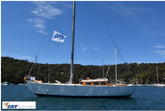
Halvorsen 36ft yacht $39,900 Reduced to sell!

ROPAWE is a head turner! She has competed in 3 Sydney to Hobart races with her medals proudly displayed on the bulkhead. The yacht oozes charm and character along with her historic finishes that would have had some interesting tales told around the oversized settee, butterfly style table. A beautiful yacht.