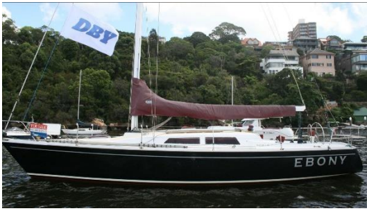
Northshore 38 $79,000

The Northshore 38 has been around since 1983 and is probably the best known and most successful production yacht of the era. Sailors and families looking for a club racer with cruising and comfort in mind, should start with a Northshore 38.