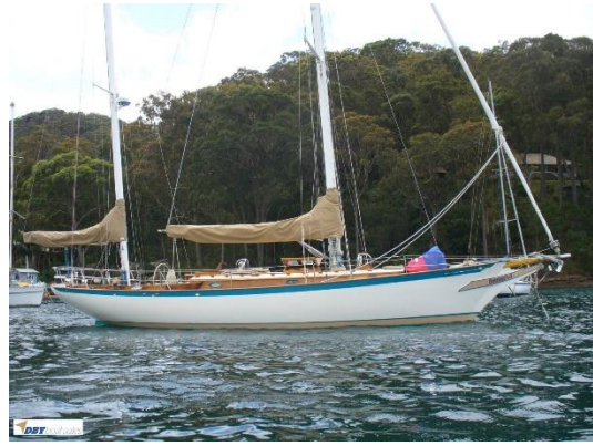
Custom 41 Bruce King Ketch $139,000

The Northshore 38 has been around since 1983 and is probably the best known and most successful production yacht of the era. Sailors and families looking for a club racer with cruising and comfort in mind, should start with a Northshore 38.