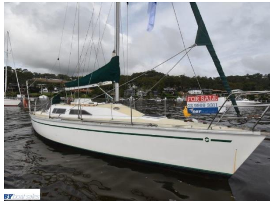
Swarbrick 38 $85,000

She features simple sailing and down below is about as roomy as any 37-footer on the market.