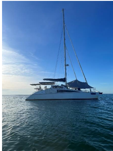
Easy 43 Catamaran $350,000

It might seem too good to be true..... but it's a reality if you want it. The 2012 model is in the popular 4 cabin layout, each with private ensuite which makes for endless opportunities to spend time onboard with large family numbers and plenty of friends. She is cavernous internally and externally and has never been chartered.