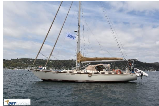
Bruce Roberts 55 $279,000

An absolutely huge 37 footer she sleeps 8 with a generous v-berth (complete with a new memory foam mattress), two huge aft doubles (each with an inner spring mattress), and a massive double in the saloon once the saloon table has been lowered. In fact, there is even a ninth berth on the port side of the saloon