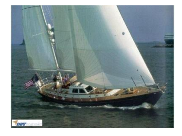
Hinckley Sou' Wester 70 $2.2M USD

See Adler is a beautiful centre cockpit enclosed pilothouse ketch with teak decks and hydraulic stowaway main and mizzen masts.