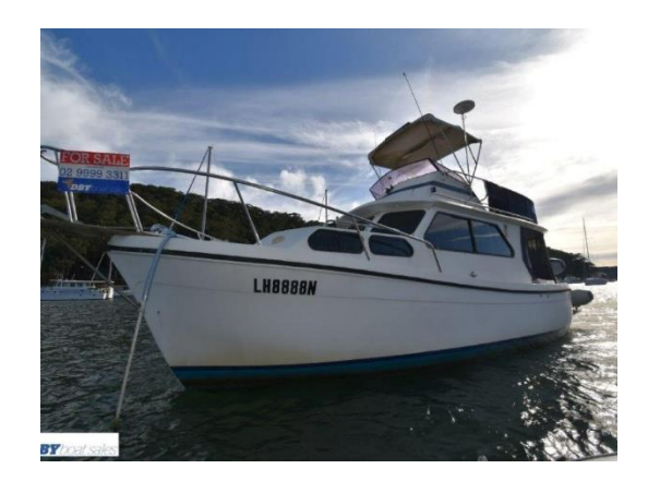
Cuddles Flybridge 30 $57,500

Her frames and bulkheads are mahogony. She is well maintained and recently the boat completed a trip across the Pacific so is fitted out accordingly. She is equally beautiful upstairs and down with wonderful warm timbers and a feature main cabin skylight.