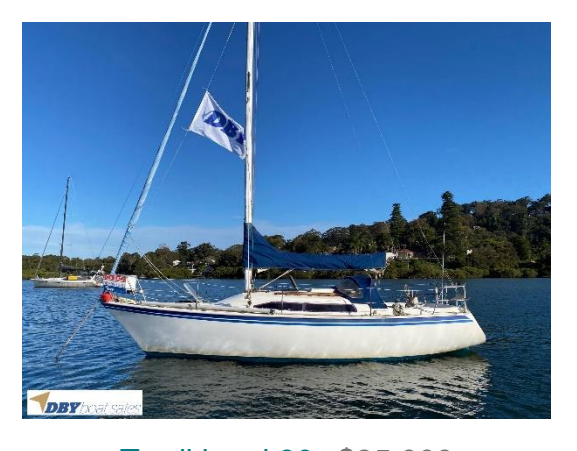
<u>Traditional 30</u> $35,000

This yacht oozes charm and character along with her historic finishes that would have had some interesting tales told around the oversized settee, butterfly style table. A beautiful yacht.