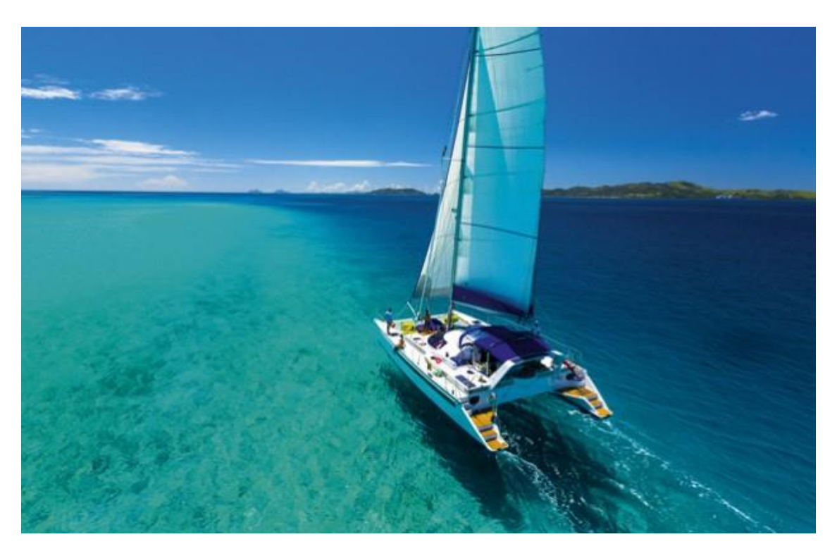
Sailing in the Pacific If this is your dream we can help you make it come true

We have created a book called "Pacific 2022" which has extremely important and interesting articles in it about sailing in the Pacific. Our sailors in the Pacific love it as it a true and authentic information booklet that everyone should have when enjoying this Ocean. Chat to us about the options to either sail your existing vessel or buy the perfect one for you and your family.