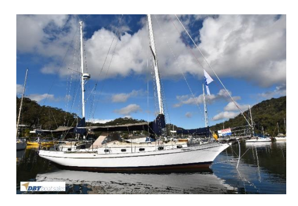
Herreshoff Mobjack 46 $120,000

With centreboards she sails beautifully, so passage times are significantly less than most other cruising Catamarans. Great for exploring shallow waterways and can be beached.