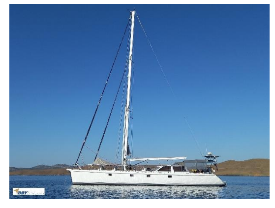
Kanter Bougainvillea 62 $790,000 Euro

She sleeps 8 in comfort and features salon areas in the pilothouse as well as below decks. Built for a very knowledgeable sailing family, she has been thoughtfully appointed in classic style with all the amenities and provides the wonderful sailing and cruising experience for which Hinckleys are famous.