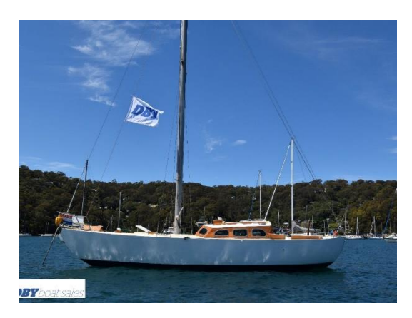
Halvorsen 36ft yacht $39,900

The interior fitout is one that oozes quality rather than price and is still in excellent condition throughout. The aft cabin is spacious and very private from the rest of the yacht.