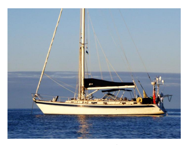
Hallberg-Rassy 46 $450,000

ANDELUNA - Totally refurbished in 2011 with new 13mm teak decks, new standing rigging, new luxury leather upholstery, new bow thruster and powered main winches, together with many other upgrades and services for ocean voyaging. This 1997 model is outstanding and has been impeccably cared for. In Sydney, ready to sail away now.