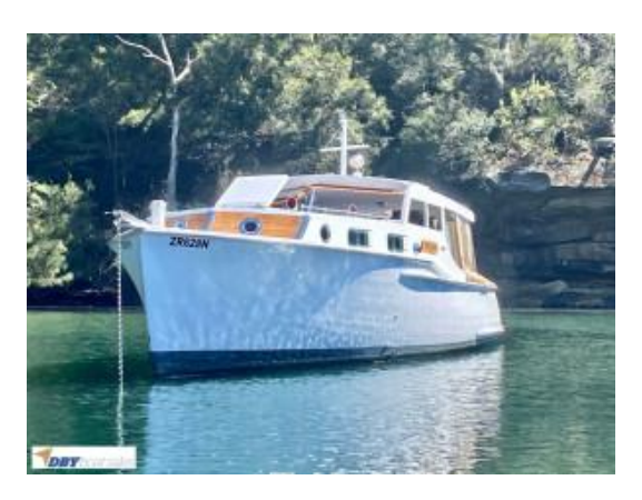
Halvorsen 25 Classic $85,000

2008 Grainger Raider catamaran built by Lightwave Yachts. More than just an easily sailed racer she is so much fun to cruise. Perfect for upriver with family with inside berths for 4 with loads more room on the trampoline. I myself own one and just love it, sailing 2 to 3 times a week mostly 2 handed.