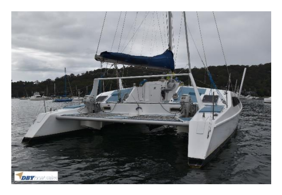
Crowther 40 $109,000

1980's Crowther 40 Mighty Manfred . GRP construction this boat is a modified Crowther 10 which was a popular design in mid to late 1980s. I was lucky enough to have owned one and sailed her to San Francisco from Sydney so can vouch for the construction and design.