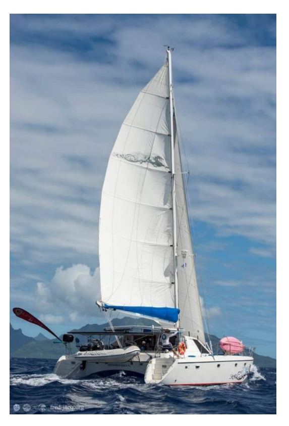
Privilege 42 Catamaran $215,000 USD

Wind Dragon is fully equipped and well maintained by her proud USA owners. The owners have her currently in Tahiti and are selling complete and ready to go on the dock in Papeete.