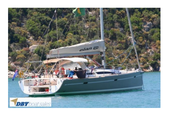
Elan 450 $190,000 Euro

So this is a rare opportunity to acquire a ready to go popular production design multihull located perfectly for your dream Pacific cruise.