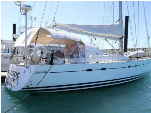
Hanse 531 $425,000

The aft swim platform is large and extends the boat so much that she feels a lot bigger than a 38 with wide flat decks - so easy to get around on.