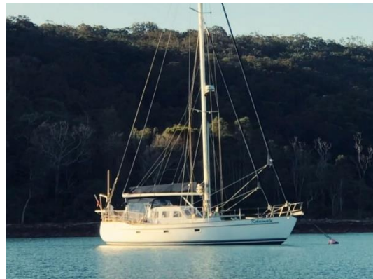
Swanson 42 $295,000

Her 2-cabin layout is extremely spacious and luxurious. She is akin to a modern apartment but floating.