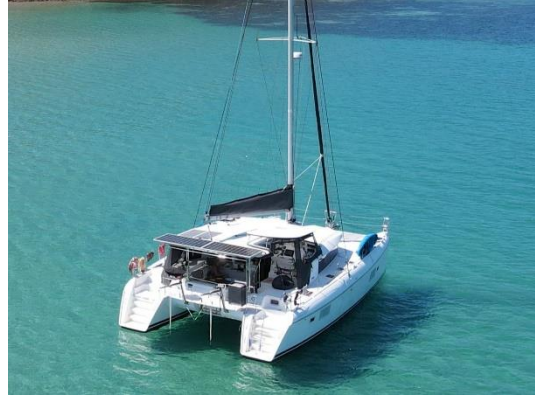
Lagoon 421 $675,000

Family boat that has never been chartered and refitted to the highest standards for a extensive circumnavigation.