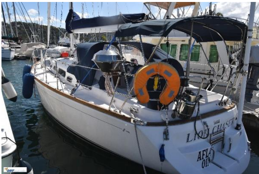
Sabre 426 $390,000

Always privately owned and never been chartered. Their continued upgrades and maintenance ensured them of a perfect and safe trip away.