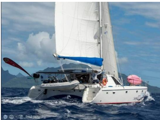
Privilege 42 Catamaran $215,000 USD

Loaded with all the cruising gear required for around the world cruising in comfort.