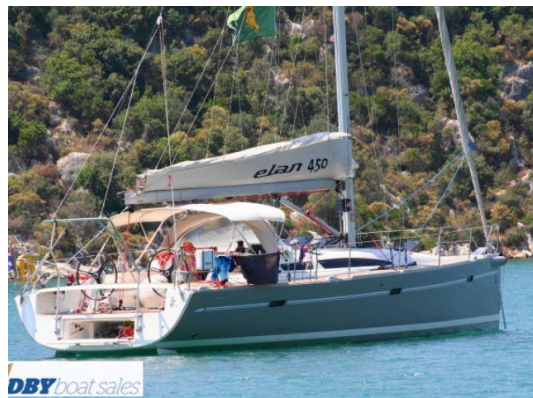
Elan 450 $190,000 Euro

So this is a rare opportunity to acquire a ready to go popular production design multihull located perfectly for your dream Pacific cruise.