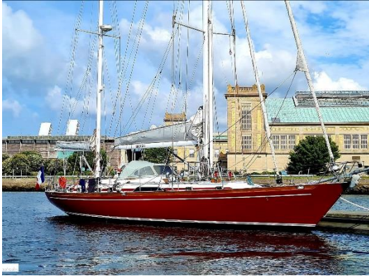
Mystic 60 $535,000 AUD

SAEMIAS is a truly exceptional yacht and one of the most instantly recognisable serious bluewater cruising yachts afloat.