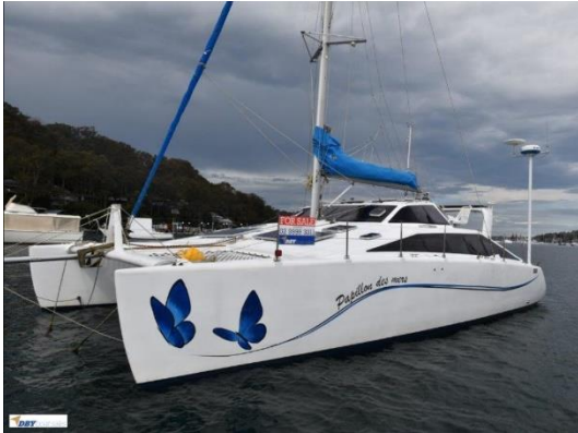
Grainger 38 $229,000

2012 Grainger designed 38-foot Mystery Cove MK2, Papillon Des Mers features 3 generous double cabins, a comfortable well-appointed galley in the port hull which allows a super impressive and large lounge, dining, good size cockpit and navigation areas. She has been designed to deliver the ultimate cruising dream