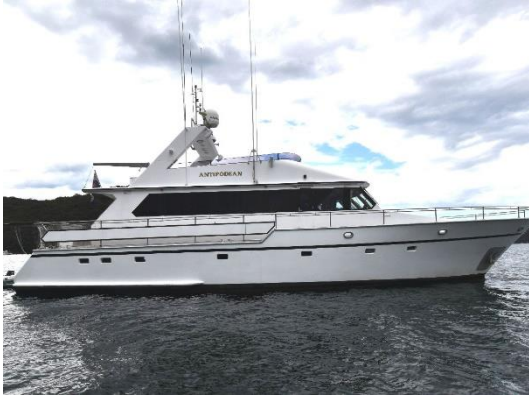
Custom Alloy 70 $950,000

Antipodean is truly a world class blue-water flybridge motor yacht. Her spectacular interior fitout is in solid teak and she boasts a total of 12 berths. Her upper level has a gorgeous, bright, open plan feel and offers 360-degree visibility from the helm aft over the chef's galley and living area.