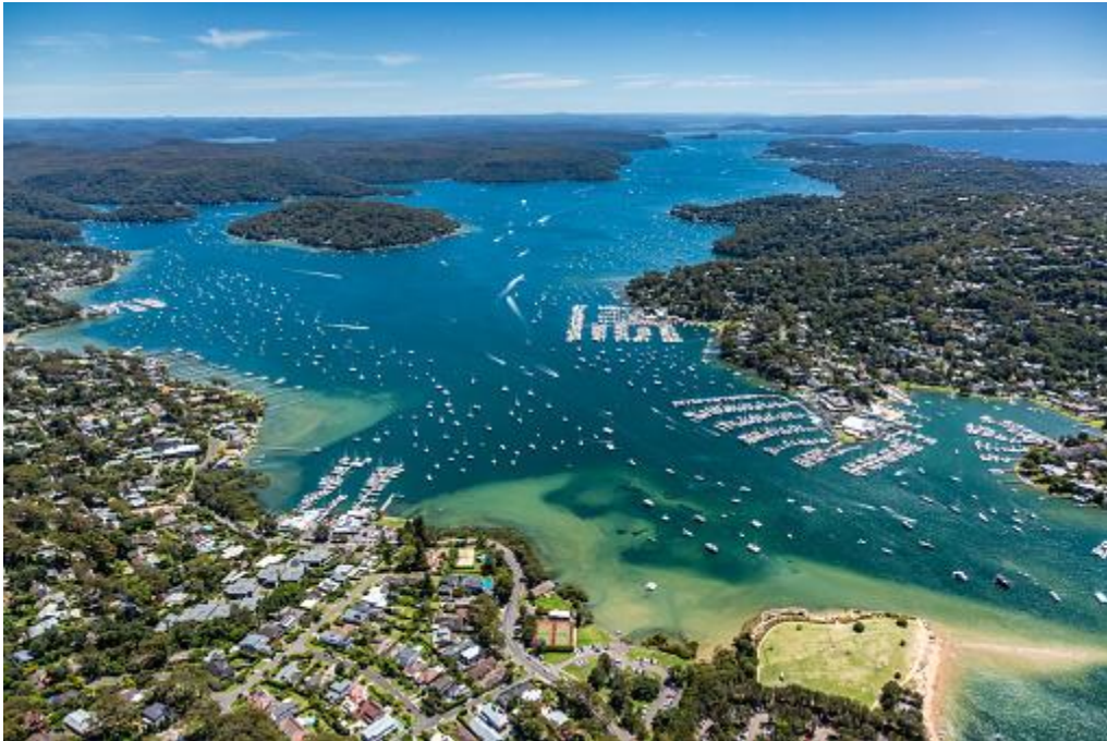
Beautiful Pittwater which is part of Broken Bay, Sydney. DBY's office is at the marina on the right.

Don't forget to follow us on INSTAGRAM and FACEBOOK for a quick look at what's new every week.