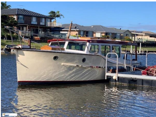
Williams Baycruiser 28 $75,000

47'7" overall custom by Brava Marine in 2009. She was operated in commercial survey in Western Australia: 22 passengers + 2 crew by day, or 12 passengers + 2 crew overnight. Absolutely gorgeous!