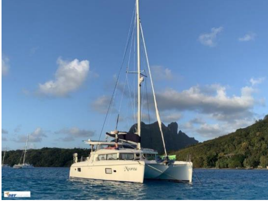
Lagoon 420 $649,000

"Moorea" is a 2008 Lagoon 420 catamaran fully equipped for safe long distance bluewater passages in 4 cabin layout. Extremely safe, reliable and comfortable.