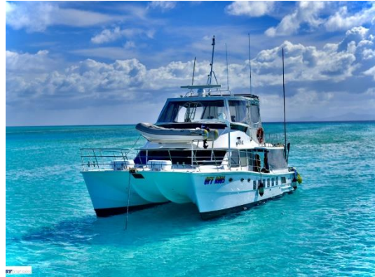
Brava Marine 47ft Catamaran $1,250,000

Antipodean is truly a world class blue-water flybridge motor yacht. Her spectacular interior fitout is in solid teak and she boasts a total of 12 berths. Her upper level has a gorgeous, bright, open plan feel and offers 360-degree visibility from the helm aft over the chef's galley and living area.