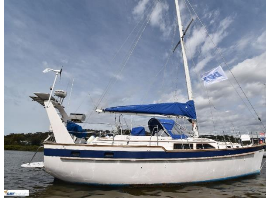
Irwin 38 $90,000

2012 Grainger designed 38-foot Mystery Cove MK2, Papillon Des Mers features 3 generous double cabins, a comfortable well-appointed galley in the port hull which allows a super impressive and large lounge, dining, good size cockpit and navigation areas. She has been designed to deliver the ultimate cruising dream