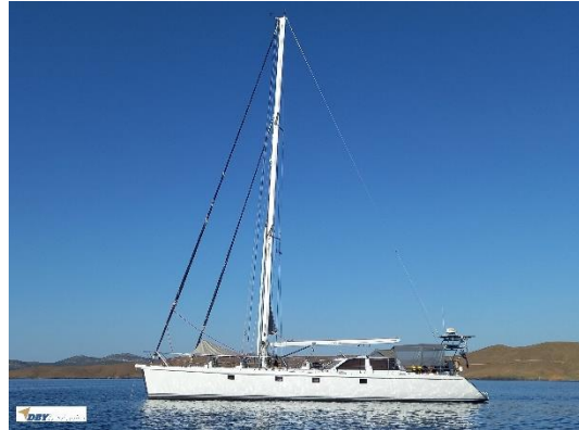
Kanter Bougainvillea 62 $790,000 Euro

Fresh from a huge 300,000 Euro, 3-year refit, she has everything needed for circumnavigation for effortless liveaboard cruising. Located in the Med.