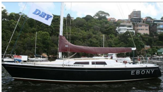
Northshore 38 $79,000

Vanish is fully equipped and ready for her next blue water adventure. Having just completed a tour of Tasmania she is truly turn-key.