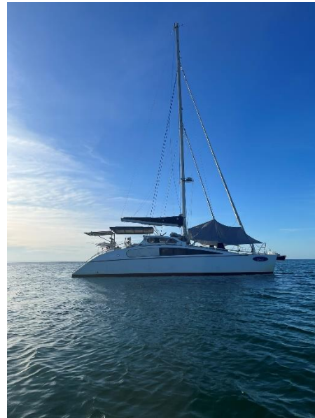
Easy 43 Catamaran $350,000

plenty of friends. She is cavernous internally and externally and has never been chartered.