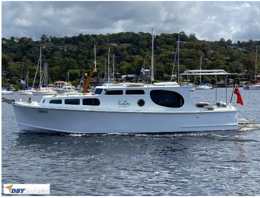
Moreton Bay 33ft Cruiser $90,000

Moreton Bay motor cruisers don't come up for sale very often and this is a prime example of the Don Hewitt designed gentleman's 33ft motor cruiser. Venture is a head turner and will be the boat the other boaties point at when anchoring into your favourite piece of harbour or bay/anchorage.