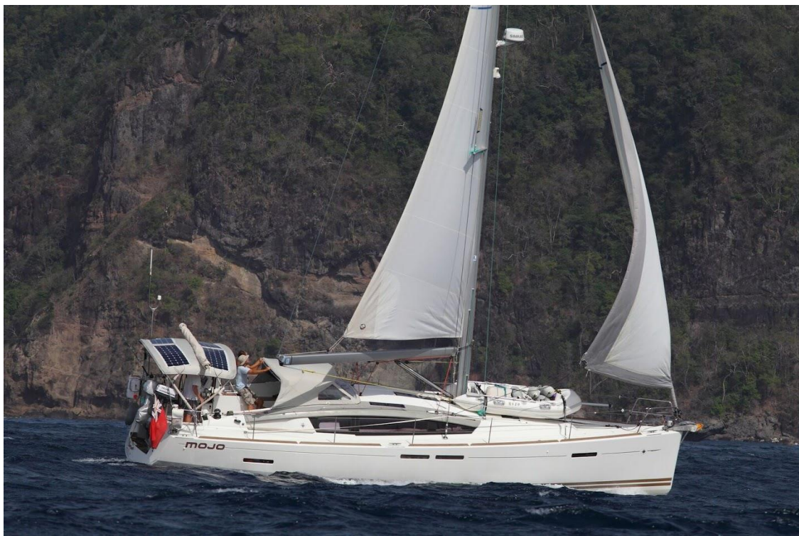
Jeanneau Sun Odyssey 44 Deck Saloon $379,000

Mojo presents in beautiful condition and will suit someone wanting to have a turnkey ready to go cruiser.