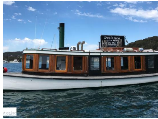
1919 Ferry / Business $200,000

Moreton Bay motor cruisers don't come up for sale very often and this is a prime example of the Don Hewitt designed gentleman's 33ft motor cruiser. Venture is a head turner and will be the boat the other boaties point at when anchoring into your favourite piece of harbour or bay/anchorage.