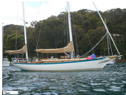
Custom 41 Bruce King Ketch $139,000

The Northshore 38 has been around since 1983 and is probably the best known and most successful production yacht of the era. Sailors and families looking for a club racer with cruising and comfort in mind, should start with a Northshore 38.