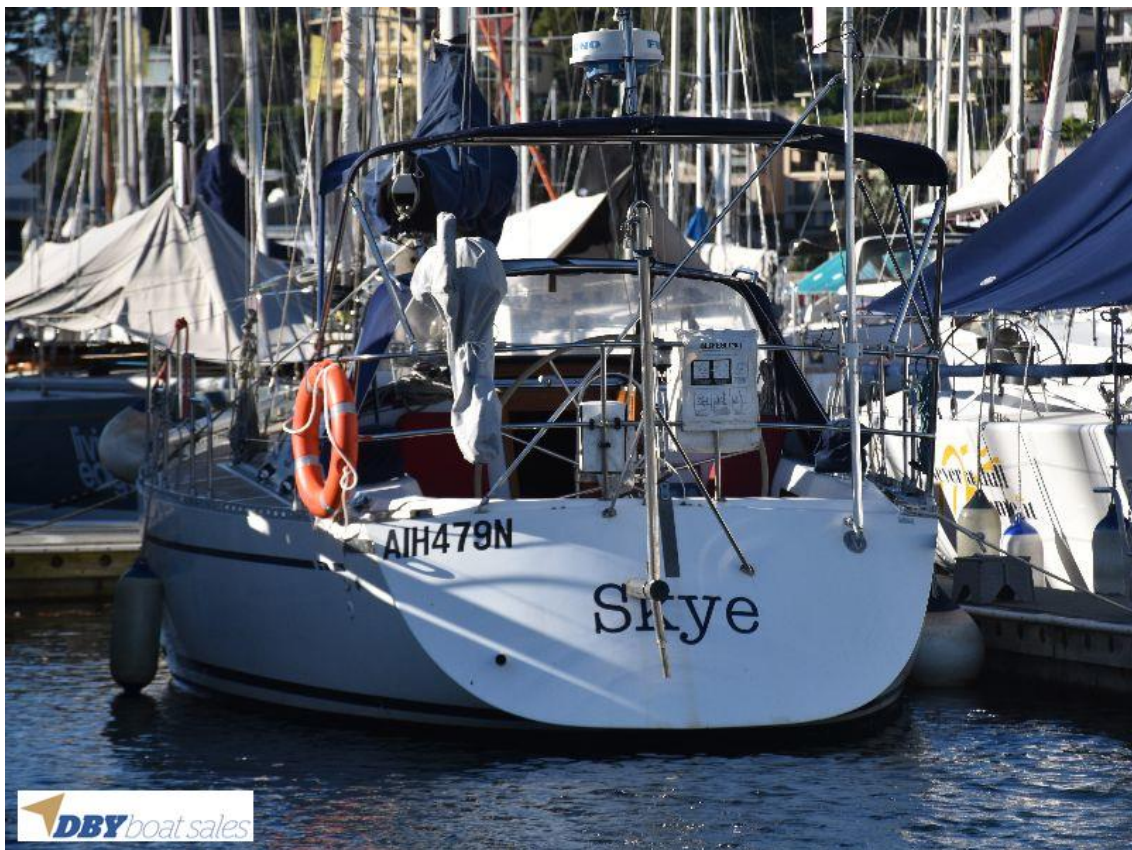
Nordic 40 $155,000