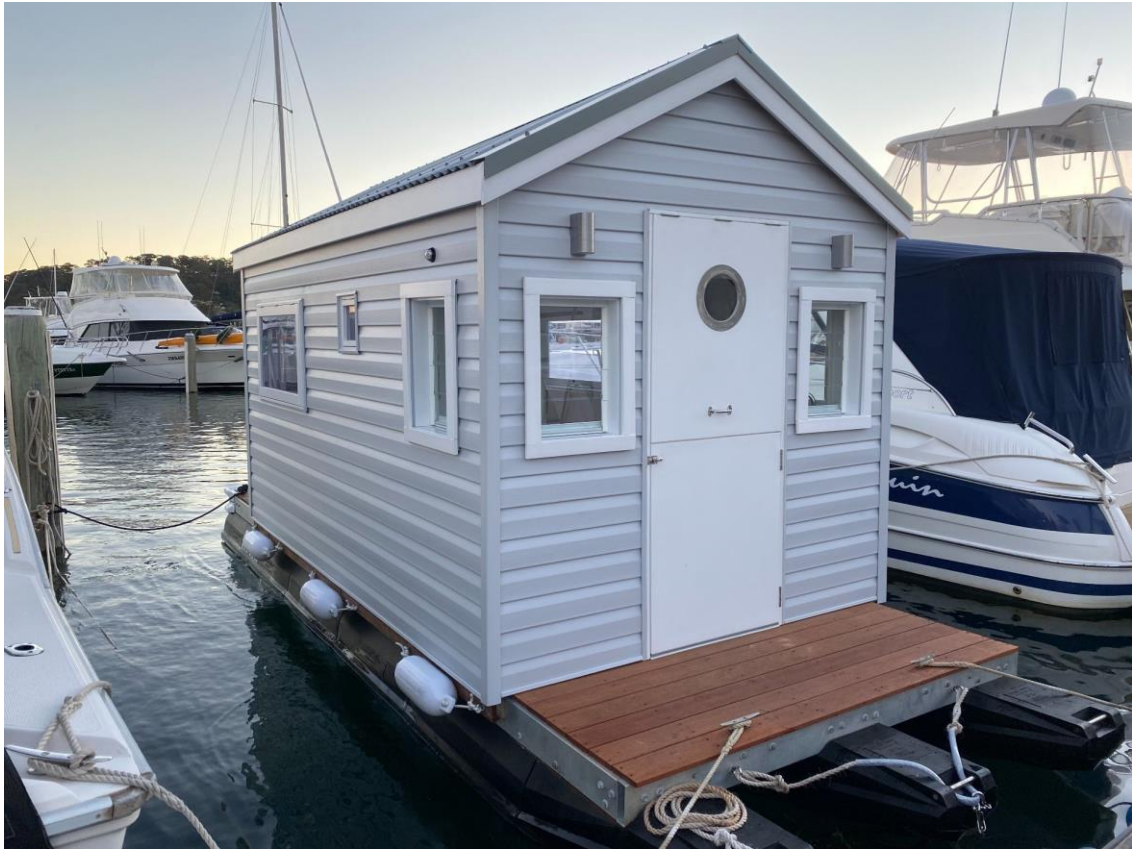
Tiny Houseboat 6.9m $95,000