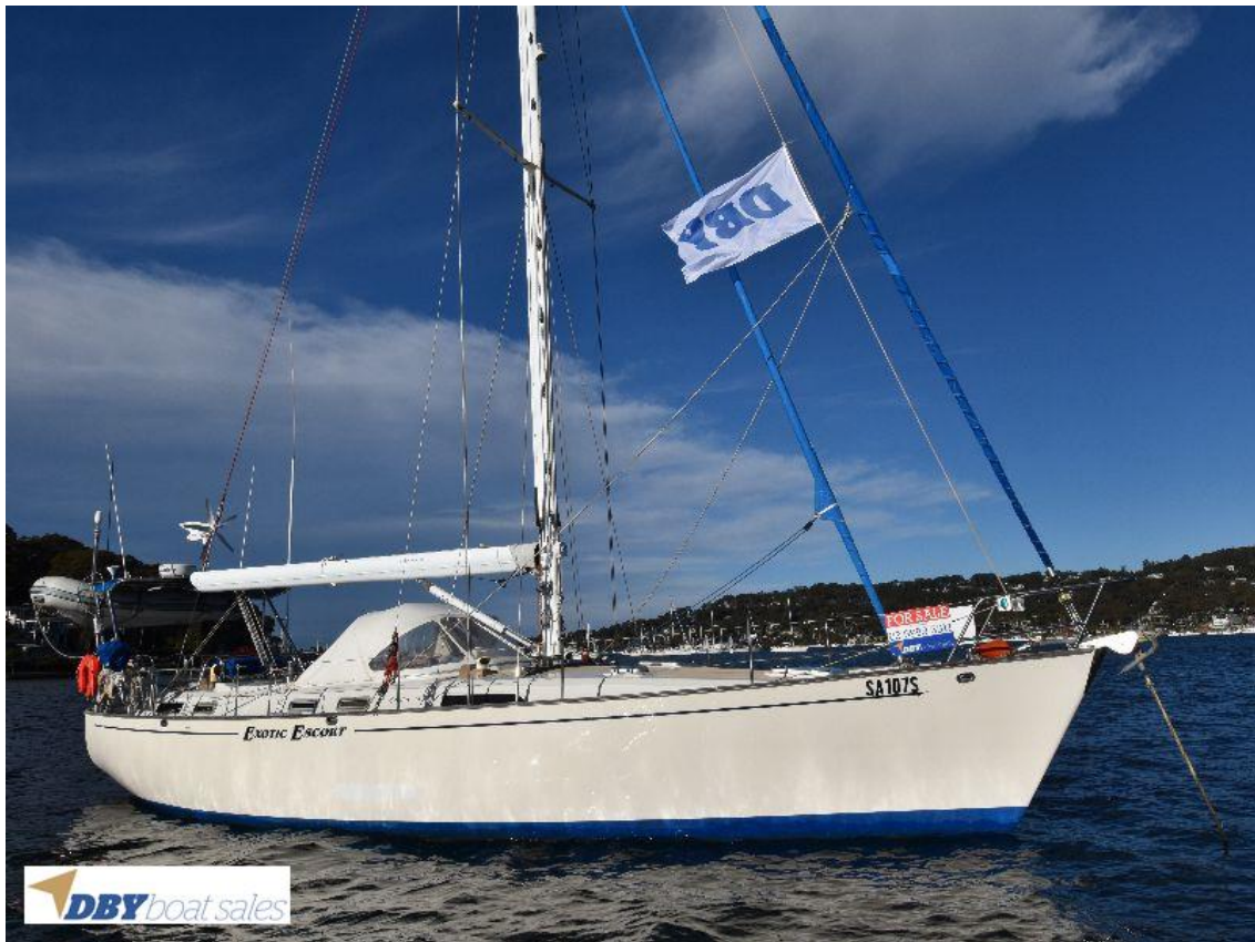
Cavalier 45 $245,000