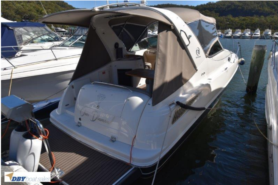
Riviera M290 Sports Cruiser $105,000