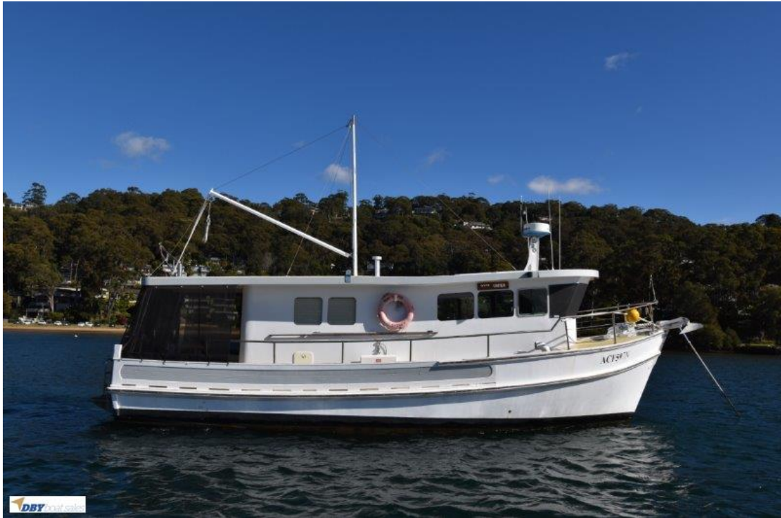
Trawler 38 $119,000