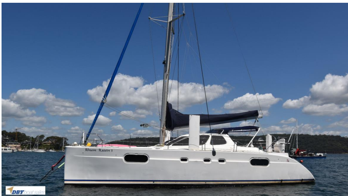
Catana 471 $549,000