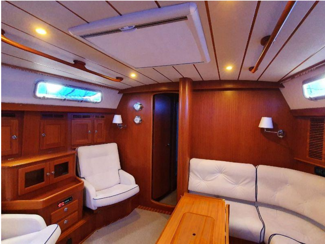
Hallberg-Rassy 54 $799,000 euro