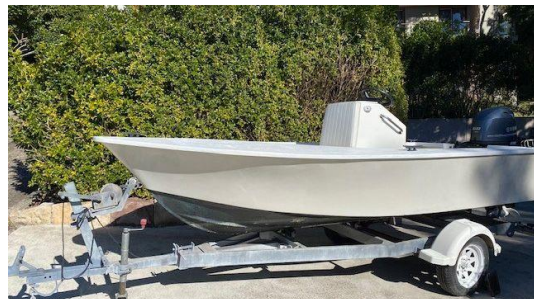
Center console fibreglass Speed boats 4.8m on trailer $24,000 4.5m runabout $14,000