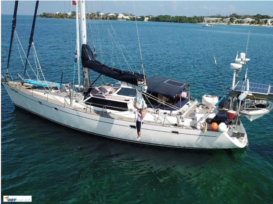
Farr 56 Pilothouse $629,000