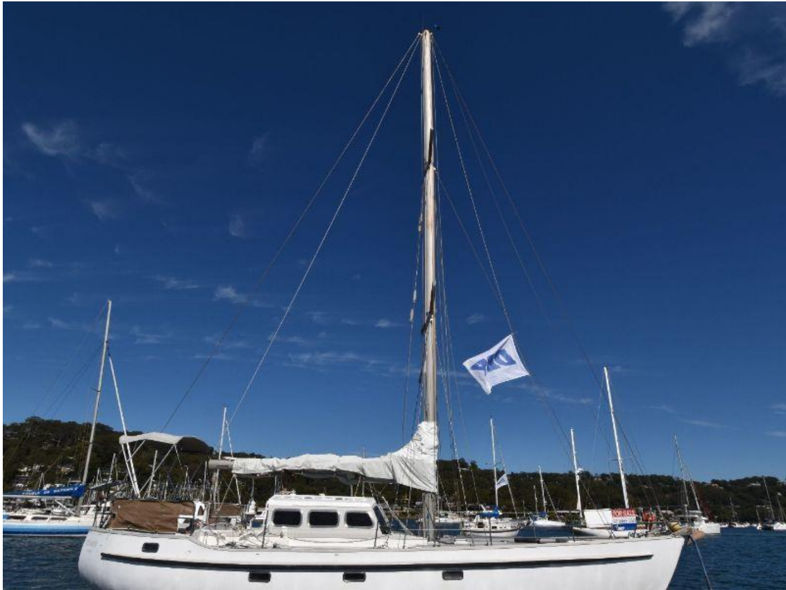
Swanson 42 $75,000