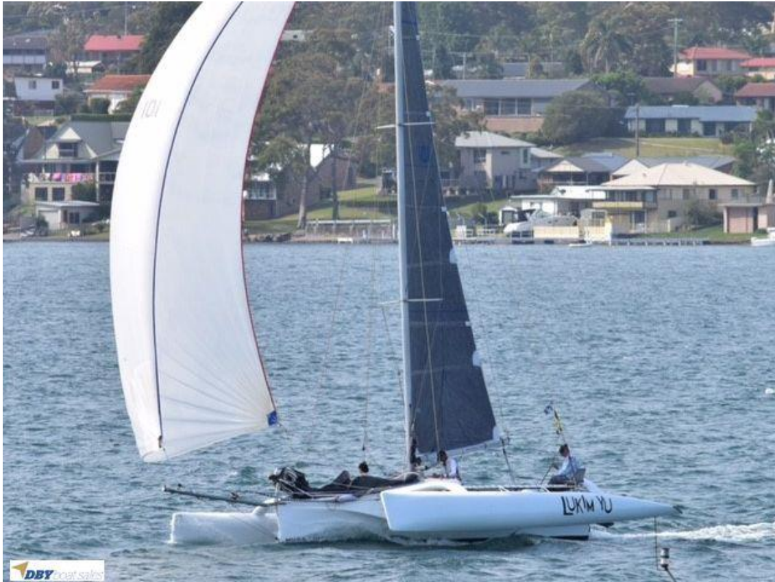
Trimaran Nusa Tiga 9m $85,000