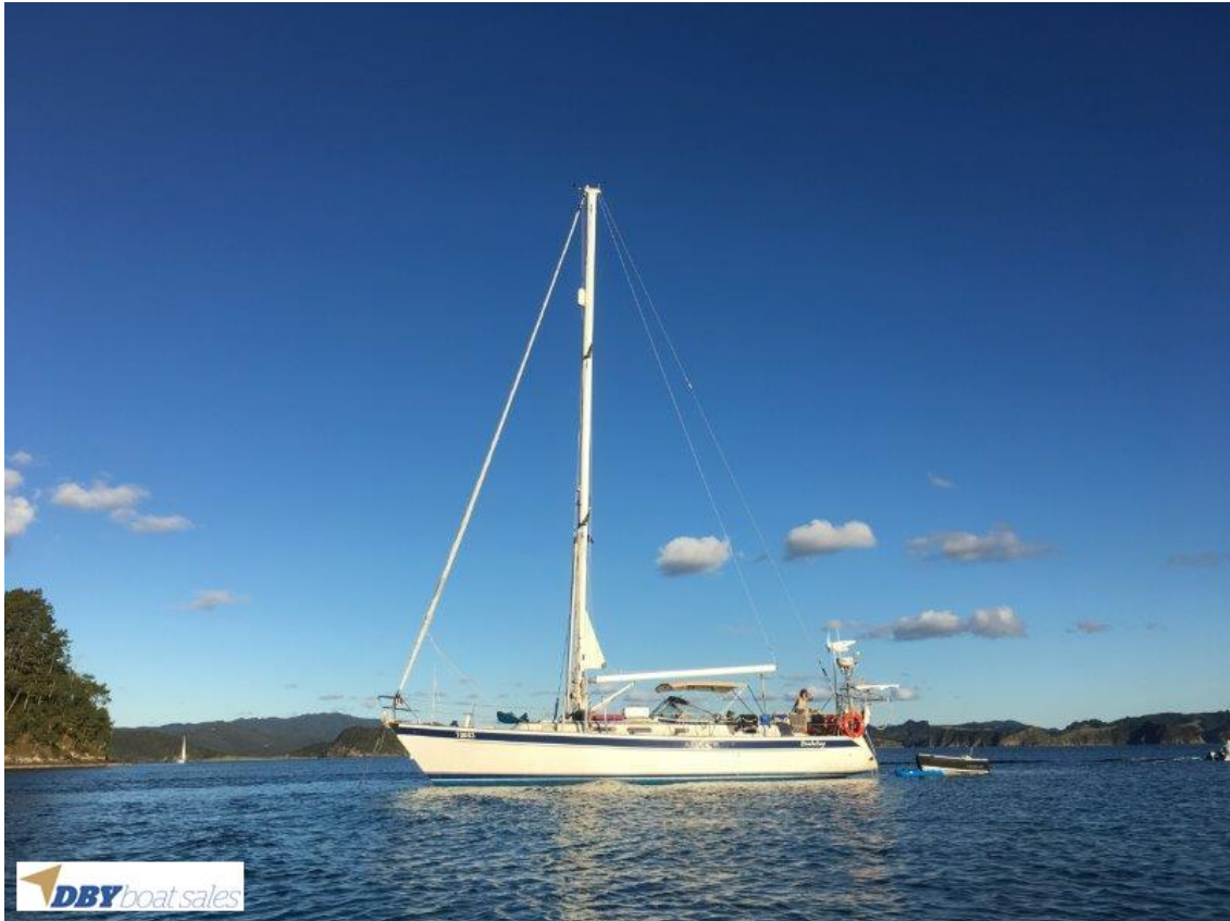
Hallberg-Rassy 46 $430,000 AU