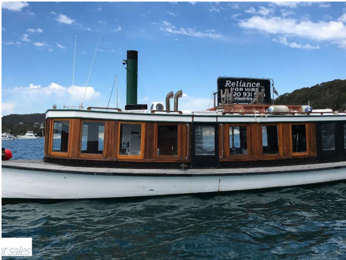
1919 Ferry $200,000