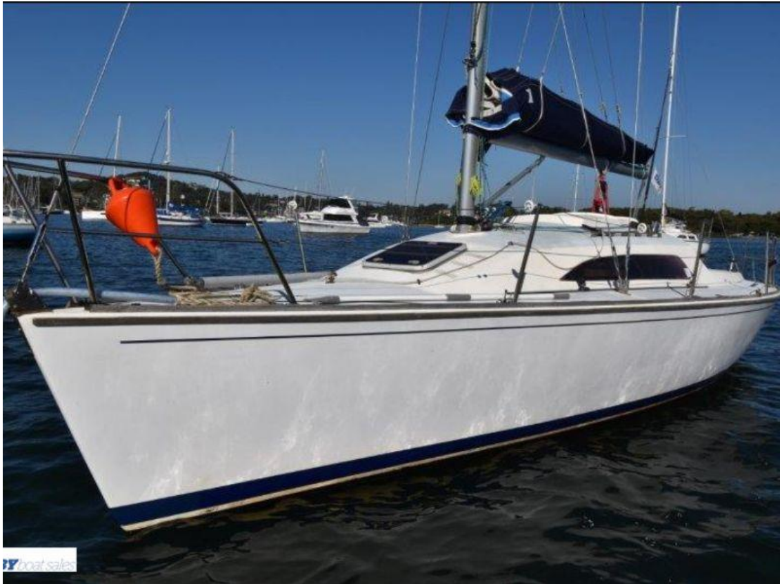
Young 88 $39,000