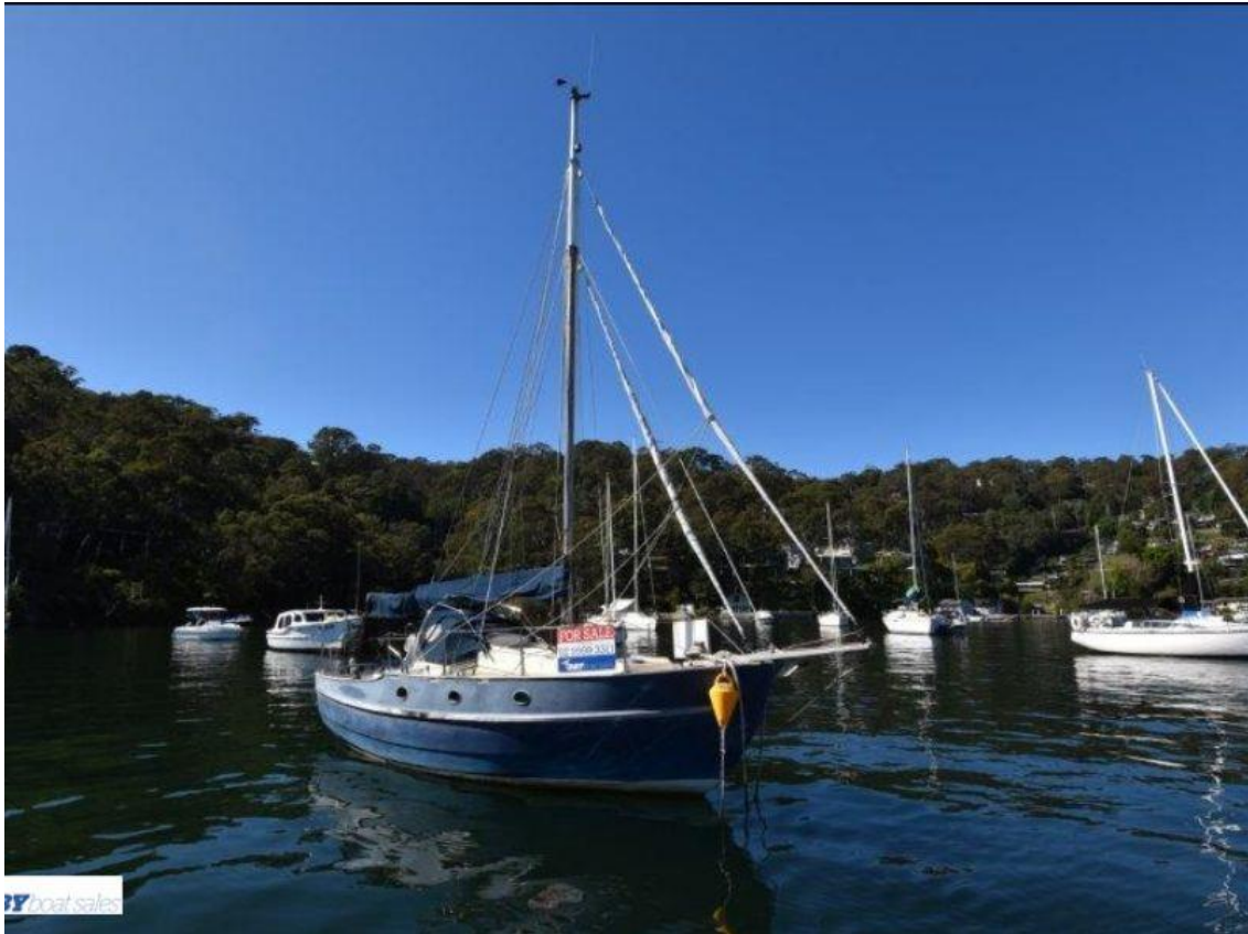
Yarmouth 23 $35,000