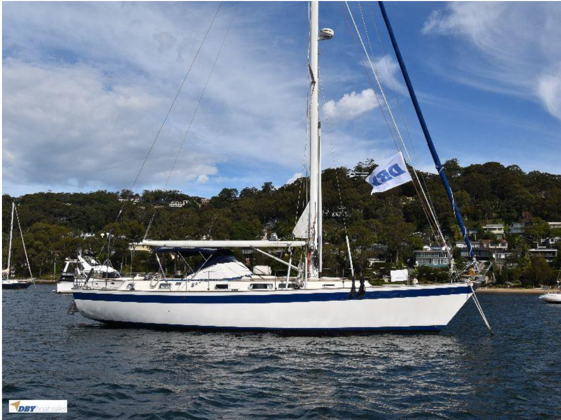
Hallberg-Rassy 45 $295,000