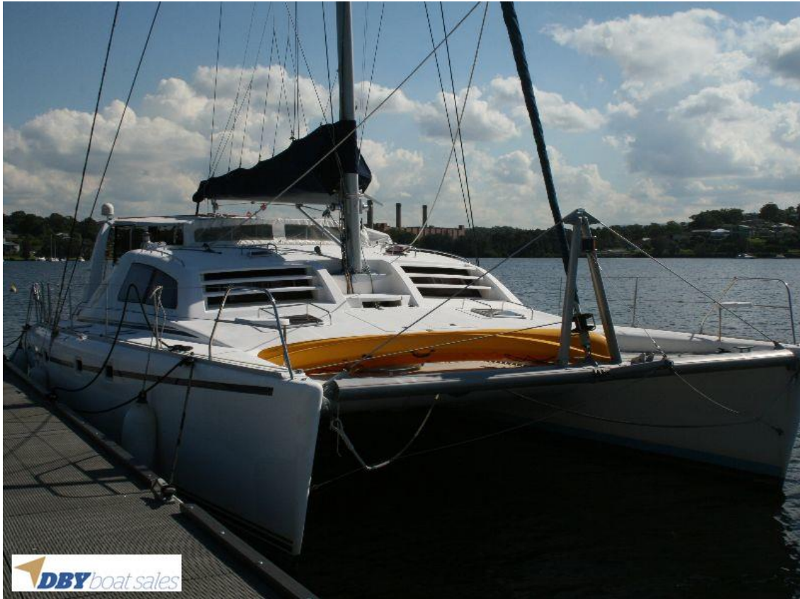
Leopard 47 $350,000