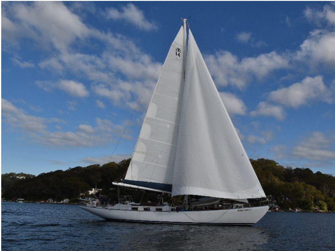
John Alden 64 Sloop $349,000 AU