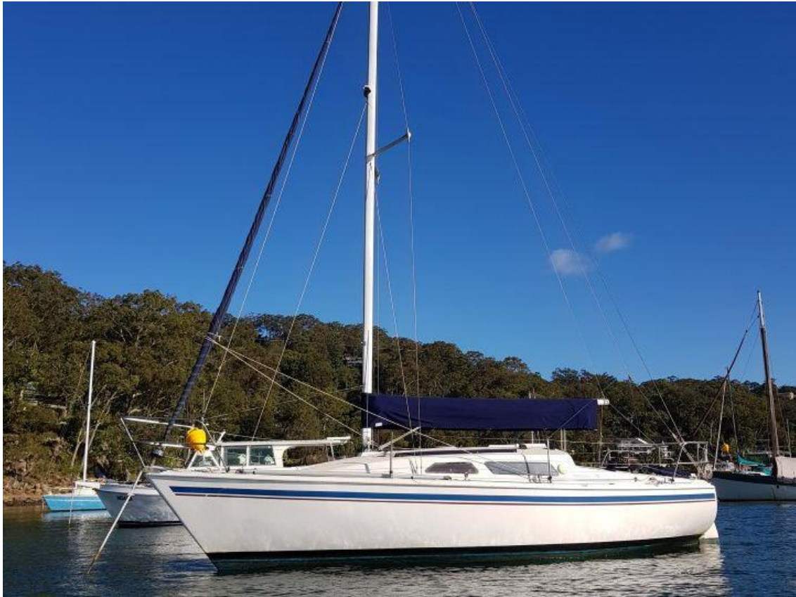
Northshore 27 $39,000