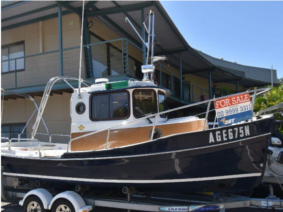
Ranger Tug $79,000

To see more of our listings go to DBY's website