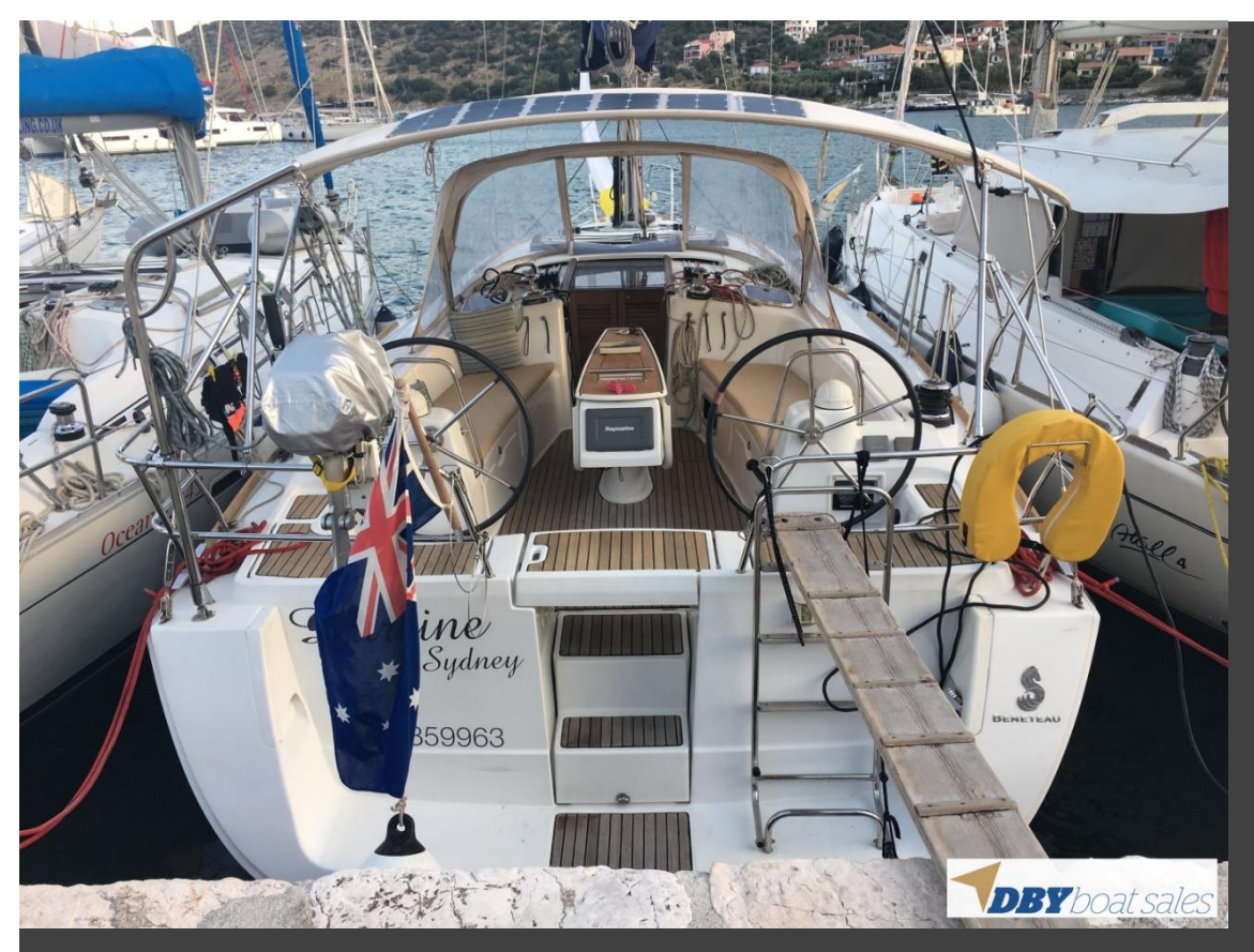
Beneteau Oceanis 40 $169,000