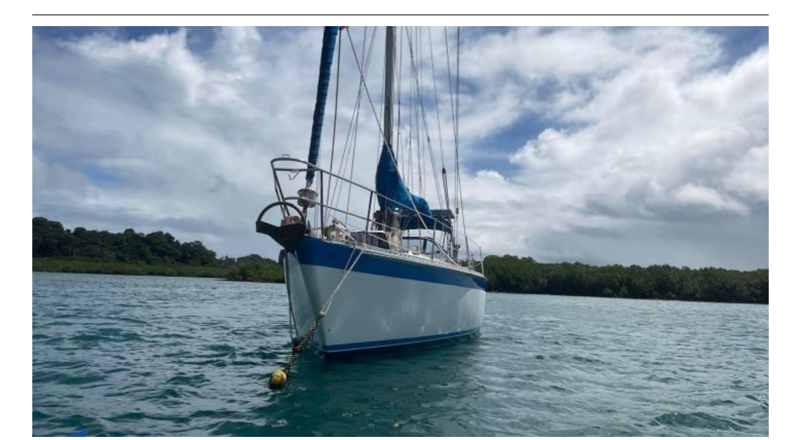
Wauquiez 38 $70,000.00

Email: sales@dbyboatsales.com.au Website: www.dbyboatsales.com.au 16 Princes Street Newport NSW 2106