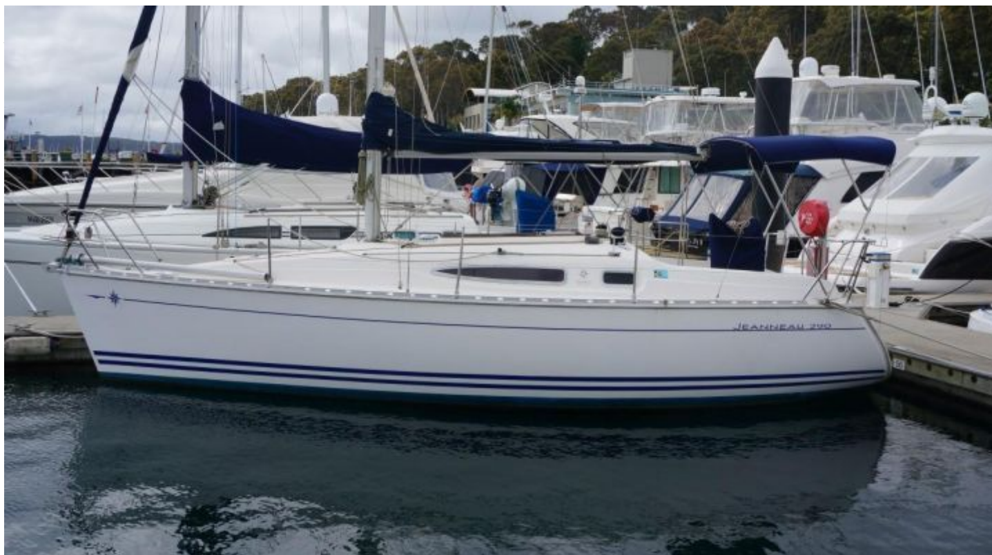
Jeanneau 29.2 Sun Odyssey