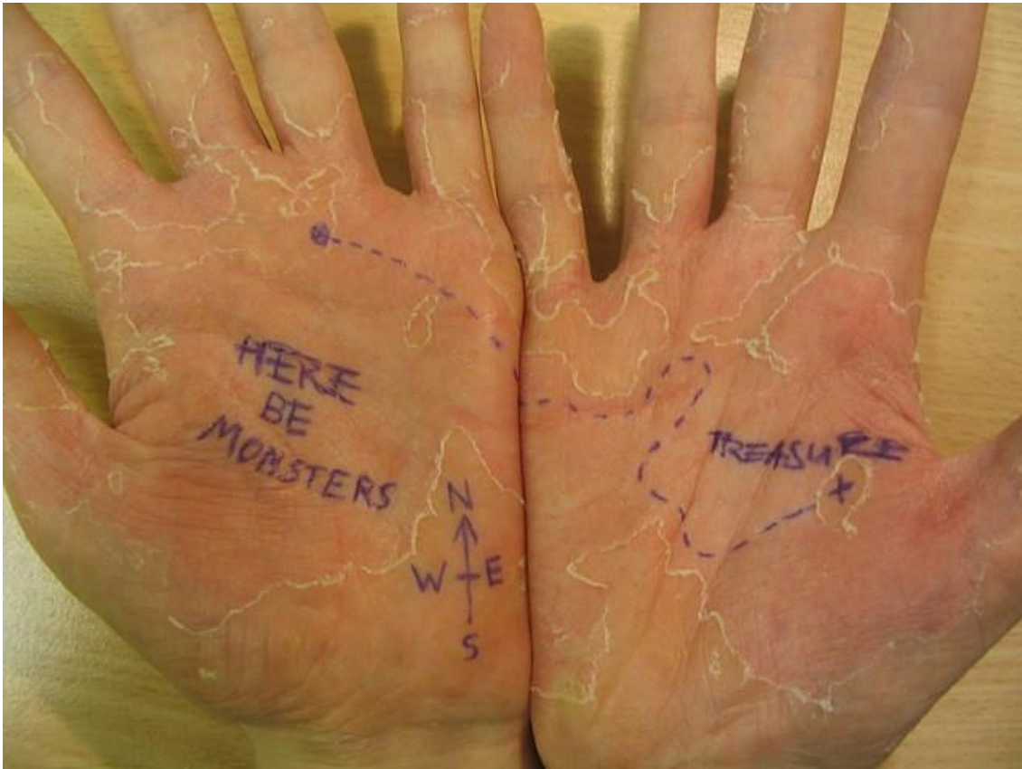
what is your definition of treasure.....