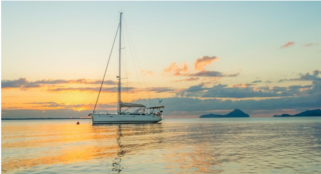
Dufour 525 Grand Large, premier model $425,000