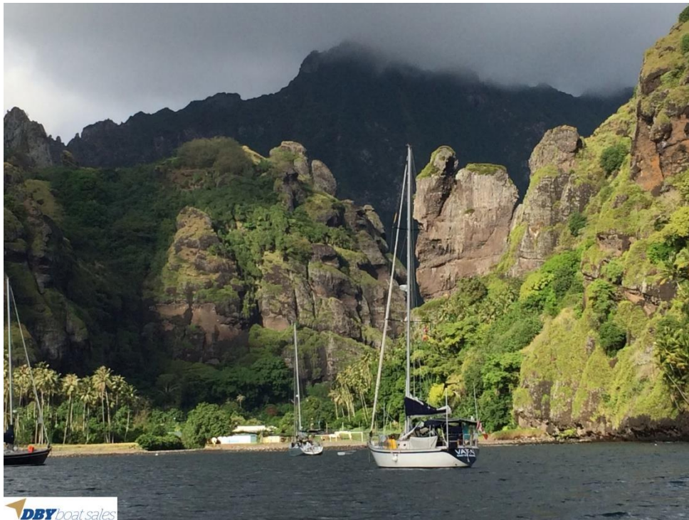
CS36 Traditional VATA, $79,000

Sold in just a few days after arriving into Pittwater, Sydney