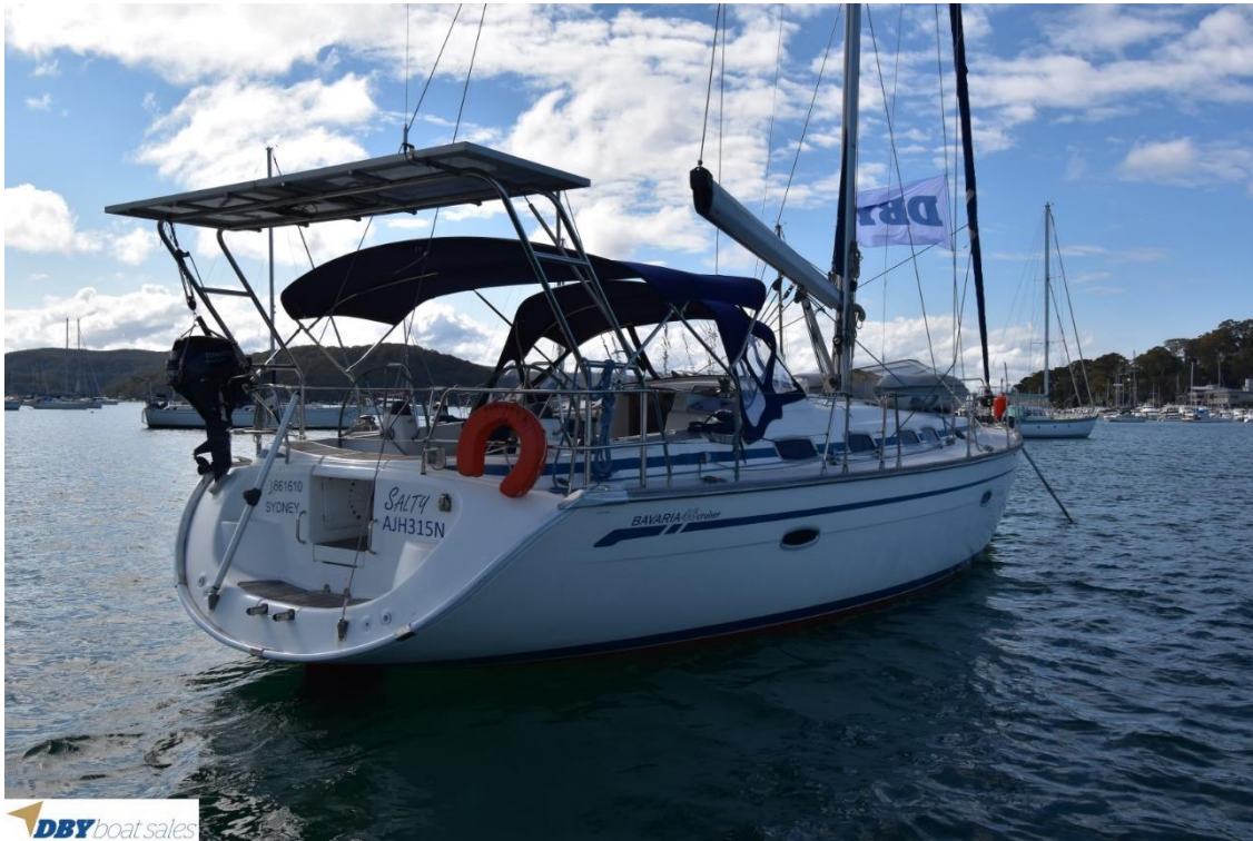
Bavaria 46 , strong and reliable $199,000