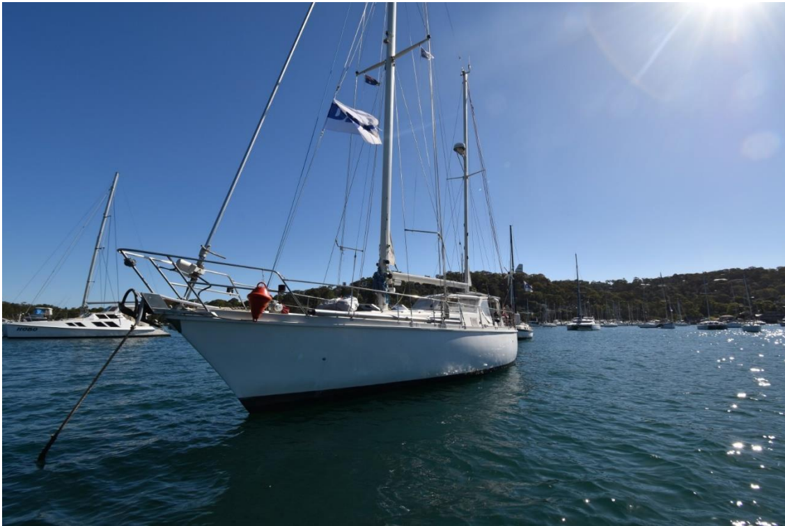
Amel Mango 52 , fully equipped and ready to go $209,000