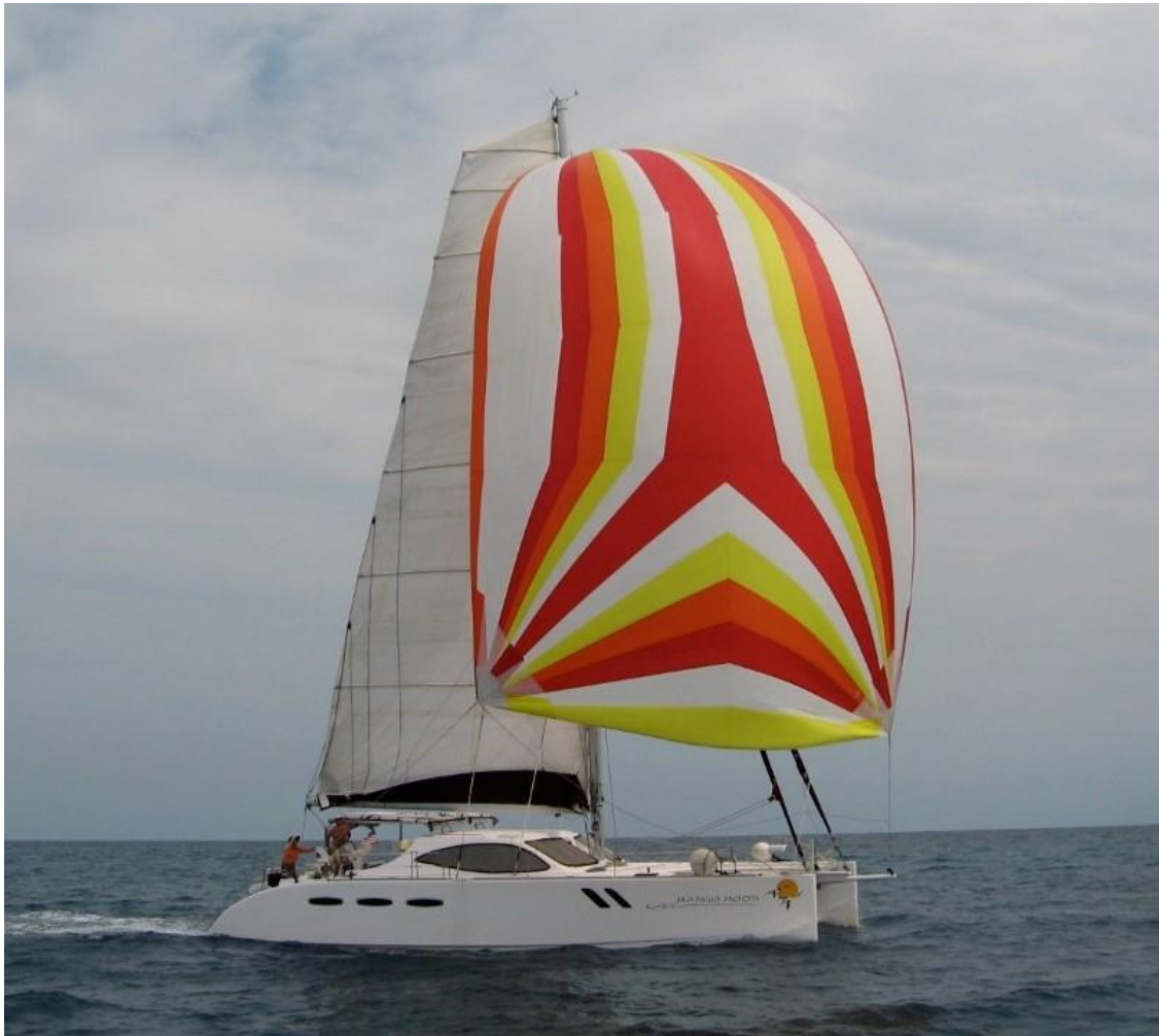
Corsair 51 , world performer $750,000 USD