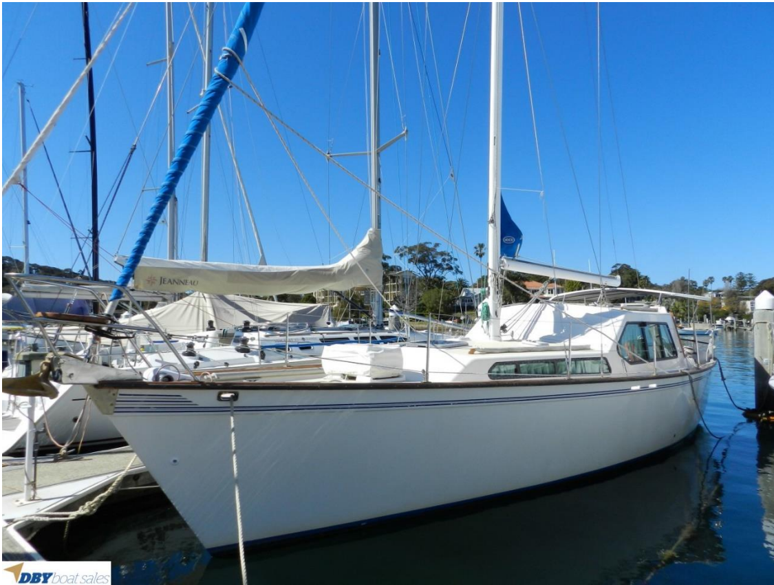
Zeston 40 Pilothouse Motor Sailor $179,000