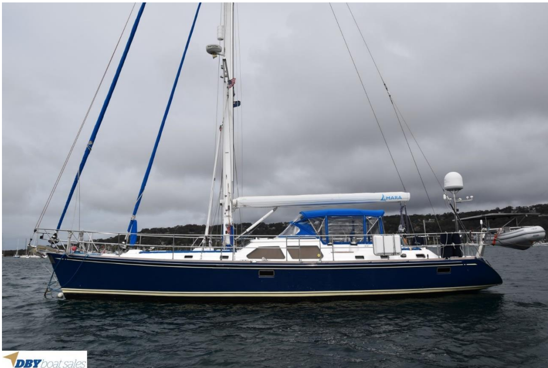
Hylas 54 , simply stunning $995,000