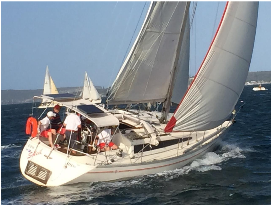
Jeanneau Sunrise 34 , ideal cruiser/racer $75,000