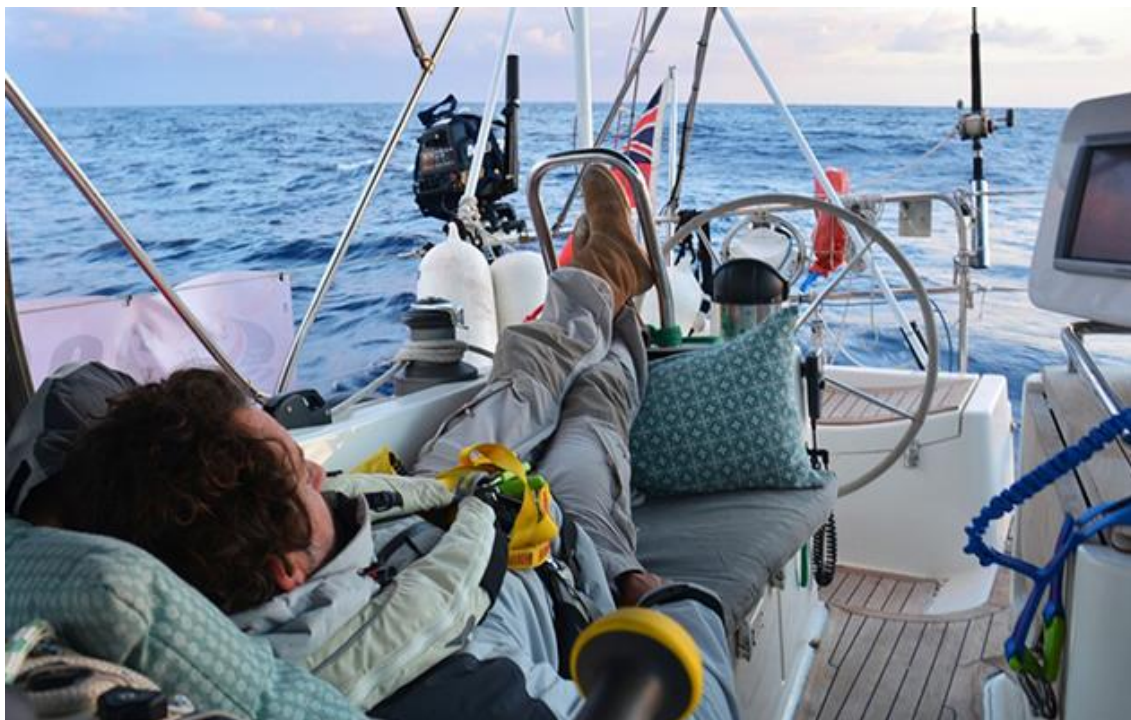
PHOTO - Living the dream...