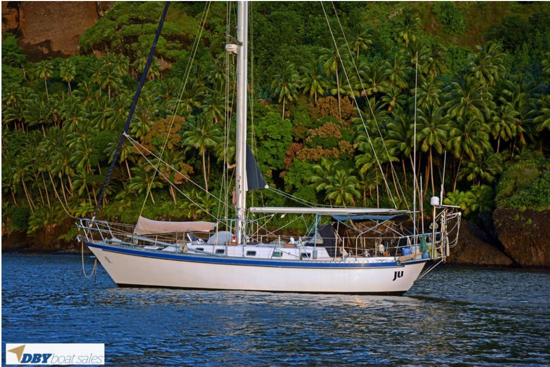
Tayana 42 $145,000 - now in Pittwater, Sydney