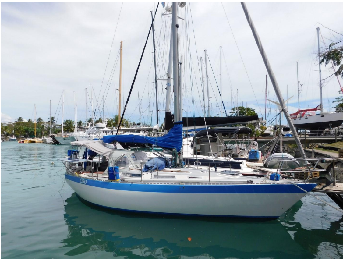
Wauquiez Gladiateur $55,000