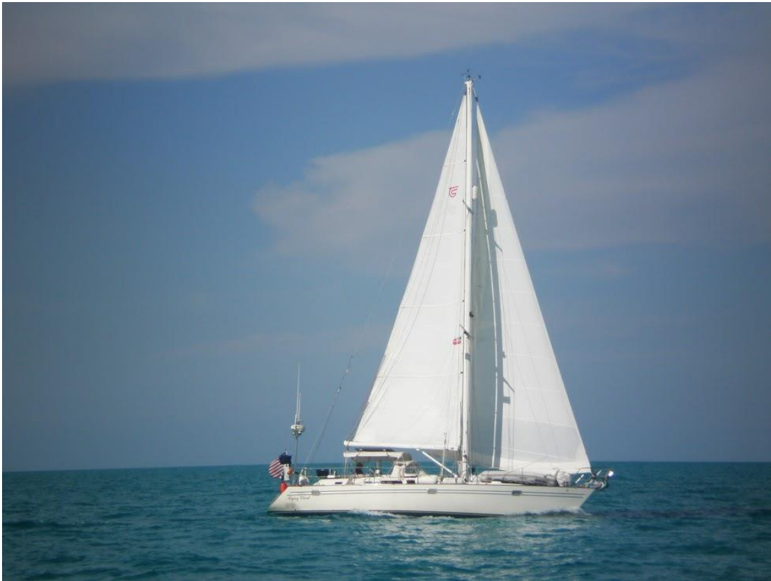
Taswell 44CC Center Cockpit, $265,000