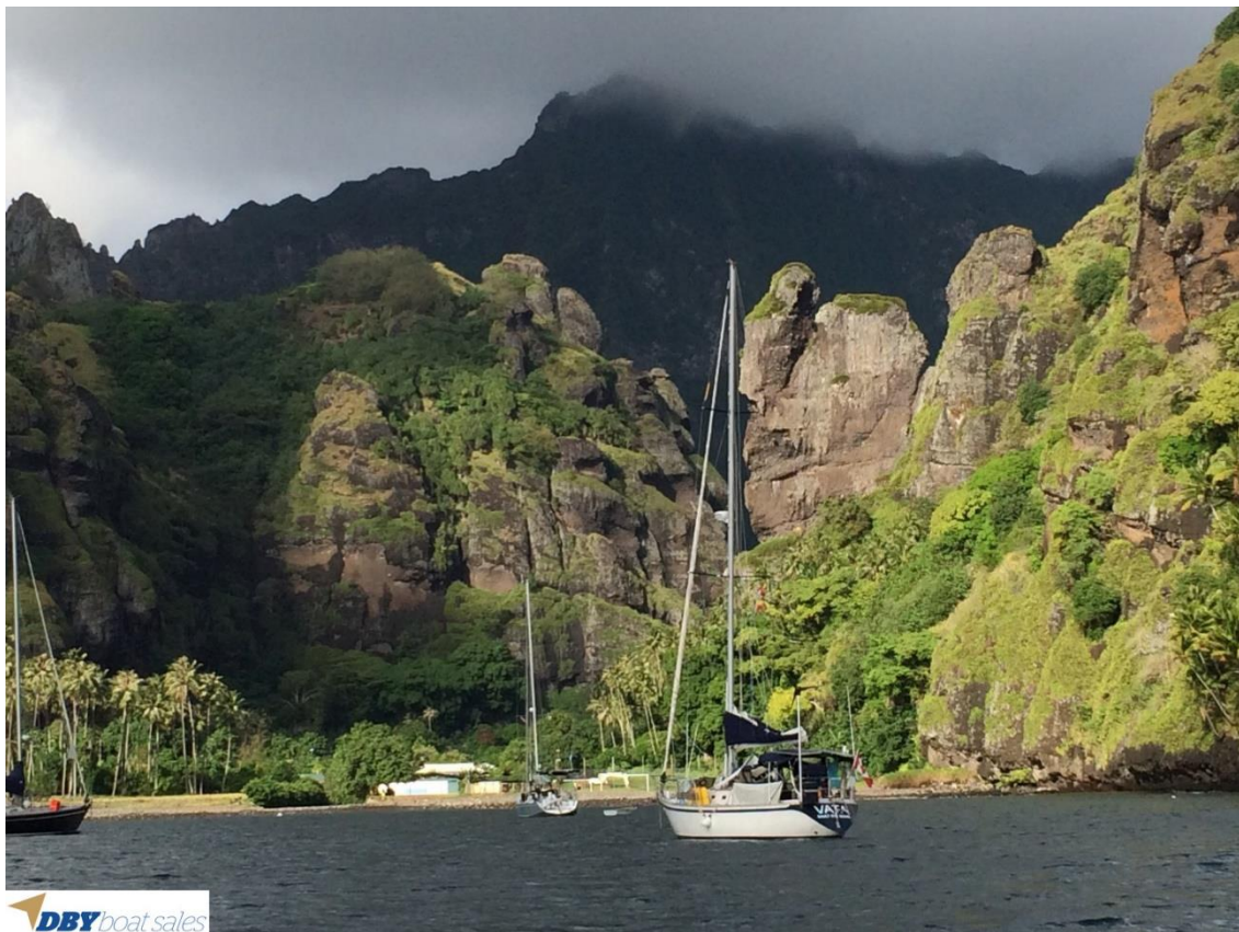
PHOTO - CS36 Traditional VATA anchored in Bay of Virgins, French Polynesia