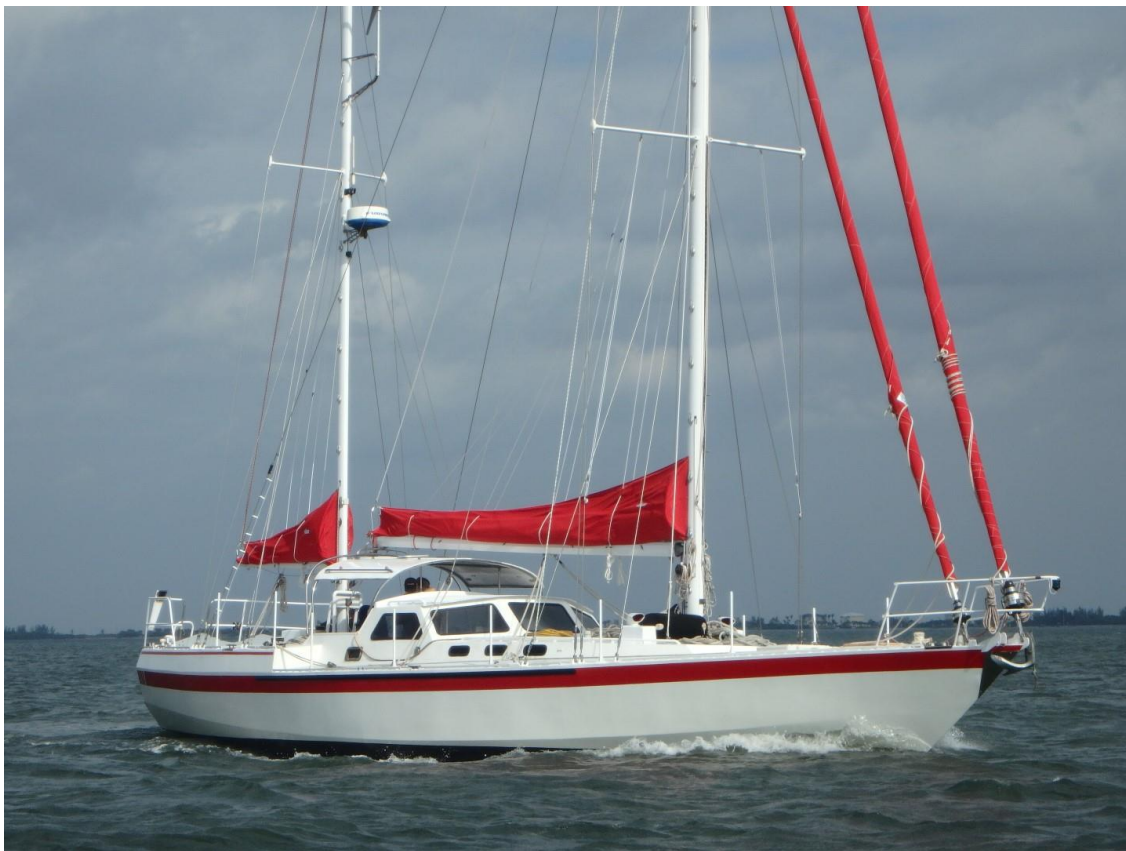
Bruce Roberts 53 BEAR , a serious bluewater cruiser $249,000